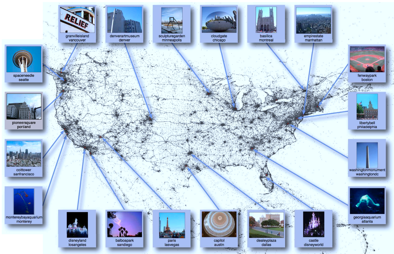
Figure 2: Representative images for the top landmark in each of the top 20 North American cities. All parts of the figure, including the representative images, textual labels, and even the map itself were produced automatically from our corpus of geo-tagged photos.

about 110,000 photos, again making it difficult to generalize their results. Their method also does not scale well to a global image collection, as we discussed in Section 3. There is a considerable earlier history of work in the Web and digital libraries community on organizing photo collections; however those papers in general make little or no use of image content (e.g., [1]) and again do not provide large-scale quantitative results.