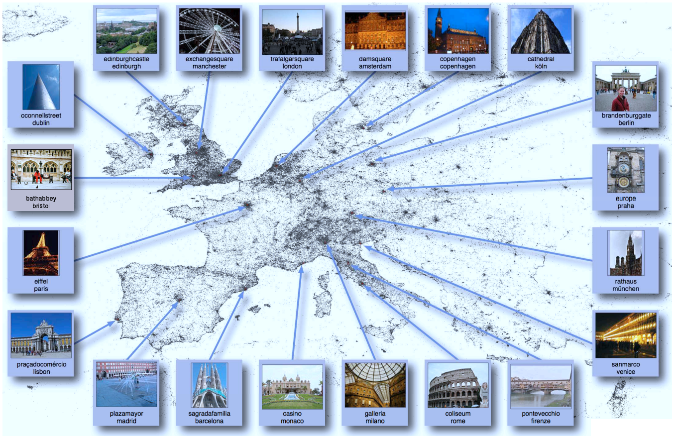
Figure 3: Representative images for the top landmark in each of the top 20 European cities. All parts of the figure, including the representative images, textual labels, and even the map itself were produced automatically from our corpus of geo-tagged photos.